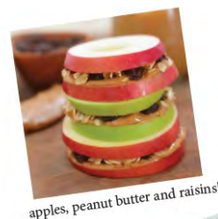
apples, peanut butter and raisins!

You know Amazin' Raisin's line of Delicious, Fruit Flavor-Infused Raisins with No Added Sugar make great, healthy, Smart Snacks on their own. But did you know they are also Amazin' in recipes? Amazin' Raisin is available in 7 mouth-watering flavors: Strawberry, Sour Lemon, Orange, Sour Watermelon, Raspberry, Sour Pineapple and Peach! What will *you* create when you take the pledge to #BeYourAmazin? The only limit is your imagination.