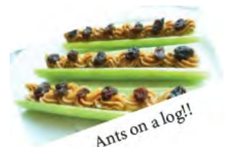
Ants on a log!!